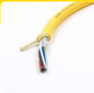
Custom Wire & Cable

If your industrial operation requires a unique solution, Amphenol TPC offers custom-engineered products designed to your specifications . These product solutions represent a unique and valuable service offered by Amphenol TPC to save you time and money. Our engineers are focused on providing the best solutions, through tested electrical, mechanical, and industrial engineering experience. There is no job that our team can't tackle. Our engineering team is ready to design a custom solution for you!