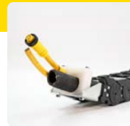
Custom Cable Carrier Systems