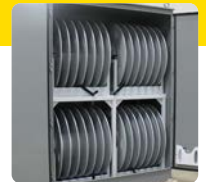
Cables Reels & Enclosures

→ For more Custom Solutions, please visit tpcwire.com