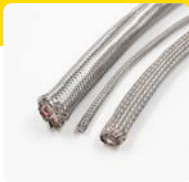
Stainless Steel Braid Sleeving