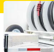
Custom Storage & Trailers